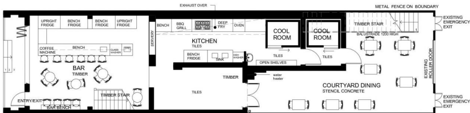
1 EXISTING GROUND FLOOR 1 : 100