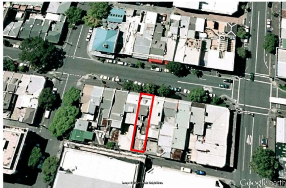
LOCATION FROM GOOGLE EARTH