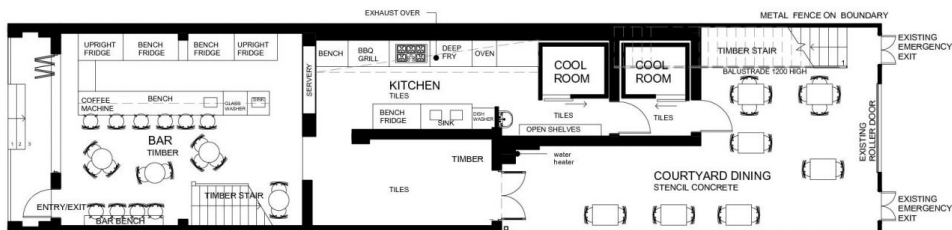
1 EXISTING GROUND FLOOR 1 : 100