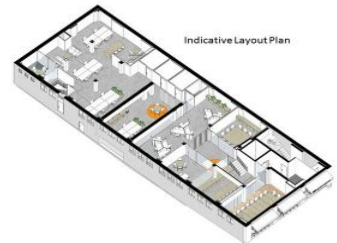
Indicative Layout Plan