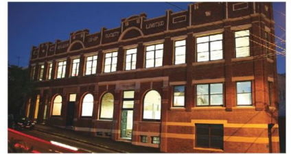
28 Montague Street, Balmain