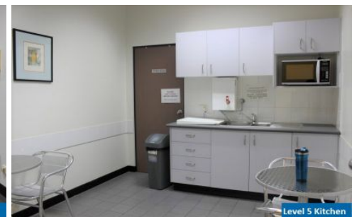
Level 5 Kitchen