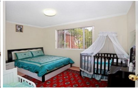
4/24-26 Sheffield Street Merrylands NSW