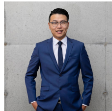
Hong Bao 02 9310 9219