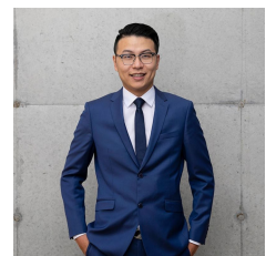
Hong Bao 02 9310 9219